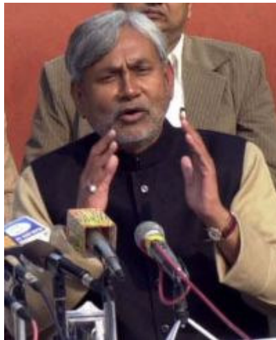
Chief Minister Nitish Kumar

Earlier, Chief Minister Nitish Kumar told the state assembly that his